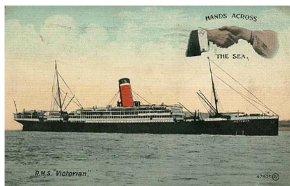
The RMS Victorian

The Victorian was steam ship built in 1904 for the Allan Line in Belfast, Ireland by Workman, Clark & Co. Ltd. At over 10,000 tons and 520ft x 60.4ft it was one of the biggest in the fleet.