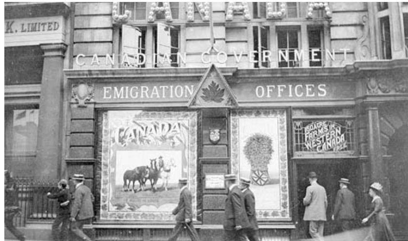
The emigration offices in London, 1911

http://www.theshipslist.com/Research/canadarecords.htm